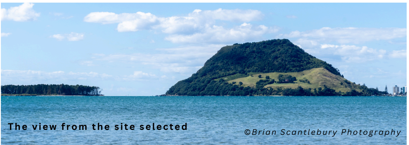
The view from the site selected